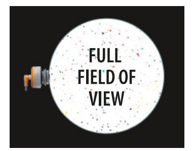
The new single detector solution

Two oppositely mounted spark detectors are required to provide a full 180 degree field of view.